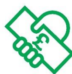
Table 1 shows the full-time equivalent annual or hourly pay rate of selected job roles in Wirral (area), North West (region) and England. All figures represent the independent sector as at March 2023, except social workers which represent the local authority sector as at September 2022. At the time of analysis, the National Living Wage was £9.50.