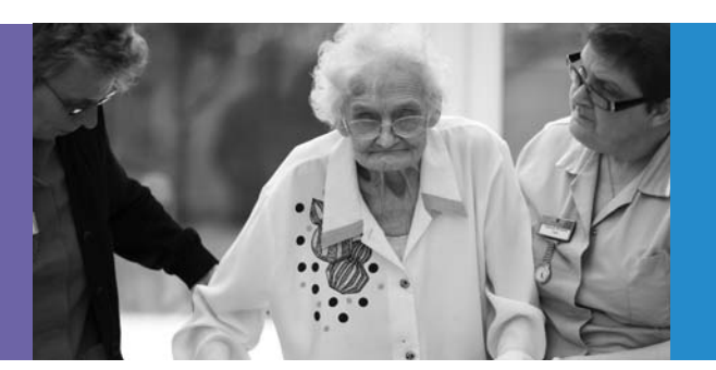
Principle 5 Recognise the signs of distress resulting from confusion and respond by diffusing a person's anxiety and supporting their understanding of the events they experience