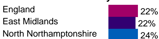
Chart 1. Proportion of workers on zero hours contracts by area

Around a quarter (24%) of the workforce in North Northamptonshire were on zero-hours contracts. Over half (55%) of the workforce usually worked full-time hours and 45% were part-time.