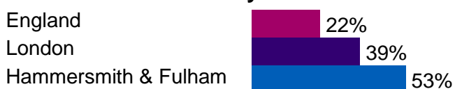
Chart 1. Proportion of workers on zero hours contracts by area

Around half (53%) of the workforce in Hammersmith & Fulham were on zero-hours contracts. Around three quarters (74%) of the workforce usually worked full-time hours and 26% were part-time.