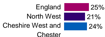
Chart 1. Proportion of workers on zero hours contracts by area

Approximately half (48%) of the workforce worked on a part-time basis, 39% were full-time and the remaining 12% had no fixed hours.