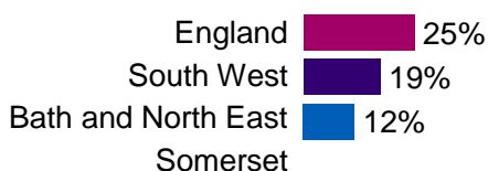
Chart 1. Proportion of workers on zero hours contracts by area

Approximately half (52%) of the workforce worked on a full-time basis, 41% were part-time and the remaining 7% had no fixed hours.