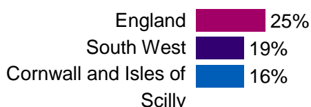
Chart 1. Proportion of workers on zero hours contracts by area

Approximately half (52%) of the workforce worked on a full-time basis, 41% were part-time and the remaining 7% had no fixed hours.