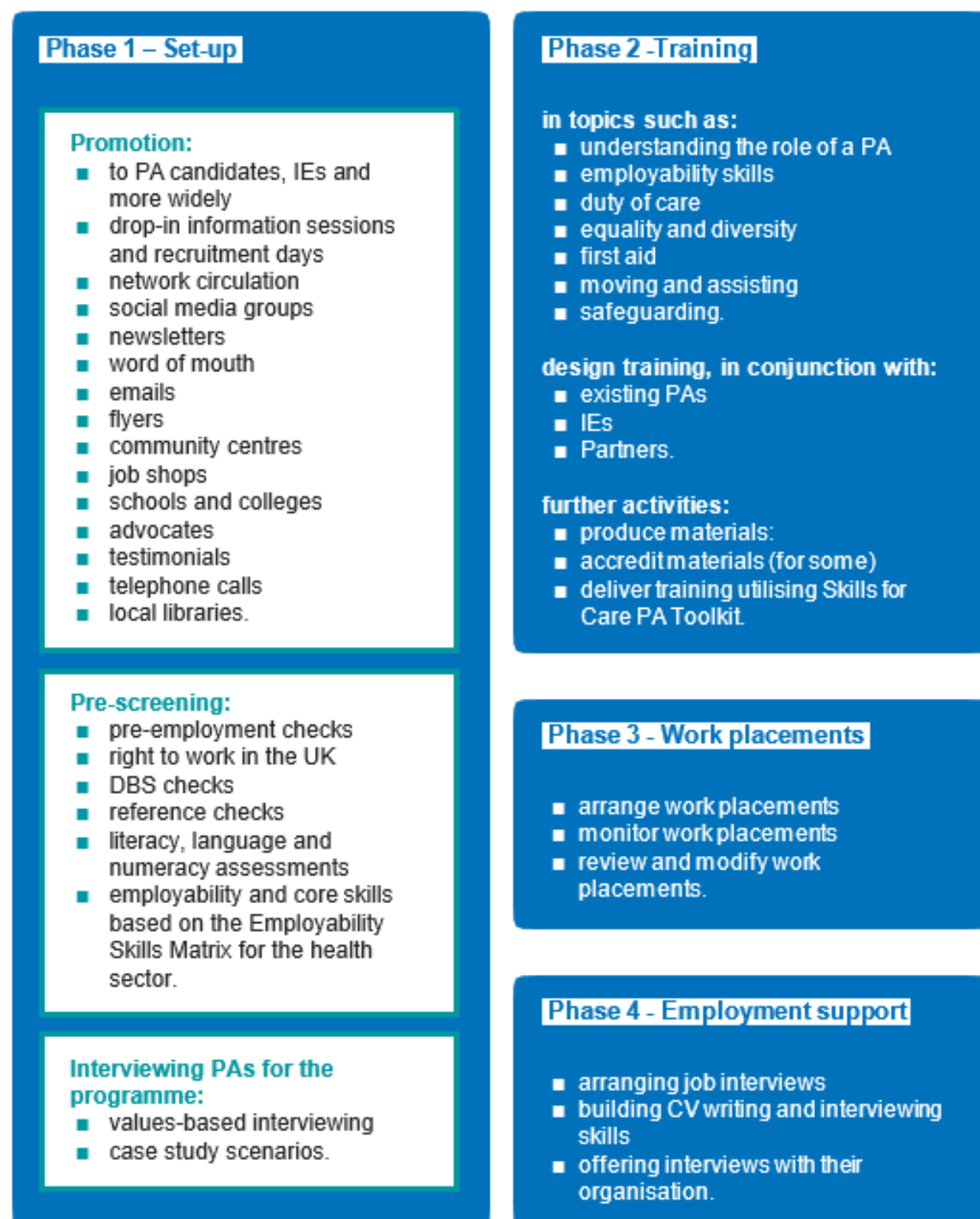
Chart 1: Common phases and activities across the four pilot projects